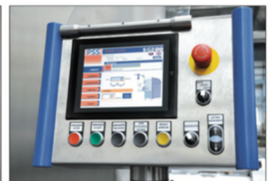
Central control panel SG 200